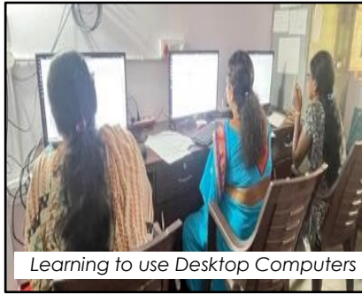
Learning to use Desktop Computers

In Sept 2023 the network, server, updated new version of Papad was setup and HEs began to learn using desktop computers to carry out basic activities of browsing the internet, emails, and using LibreOffice suites for text and numbers.