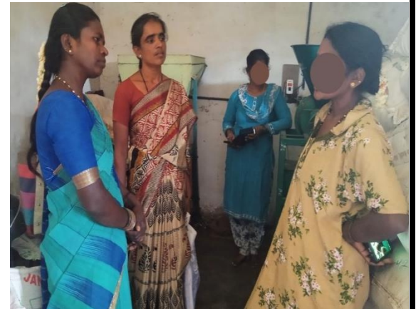
conversation with Women Farmers in Kanakapura district

The HEs sell the nutrition products to their community members, earning an individual income as well as for the collective.