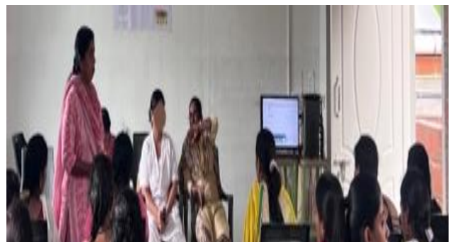
Interactive session with Junior Health Assistant (JHA) and Health Inspector from the Community Health Center, Channapatna on Women's health & family planning.