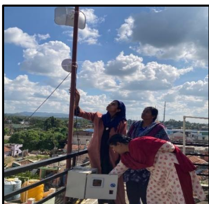
inspecting the base station network antenna

❖ Channapatna Health Library has 200 tagged and annotated, searchable audio-video, snippets about local health knowledge, practices and lived experiences.