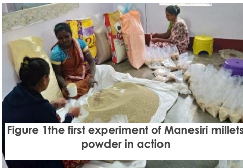
Figure 1 the first experiment of Manesiri millets powder in action

Over these three months made a profit of 13,000 INR, but more importantly, there is an increasing demand for the powder in the communities - it is versatile, tasty and healthy. The experiment is showed a clear pathway to organise as a producer company as well as confidence in management of supply-chain, logistics, finances.